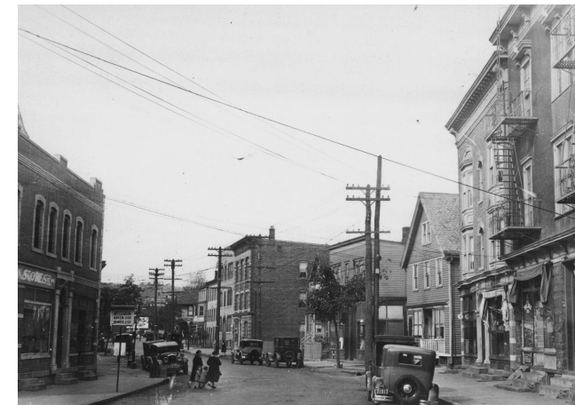
This photo, taken in 1930, is of Glenridge Avenue looking west. Notice the buildings on the right side of the street – 55 and 57 – discussed below.

In 2002, two railroad lines servicing Montclair were joined via a new track and grade crossing on Glenridge Avenue at “the Montclair Connection.” The “Montclair Line” entered Montclair south of Glenridge Avenue and terminated at Bay Street. The “Boonton Line” ran a few blocks north of Glenridge Avenue with stations from Walnut Street to Montclair Heights. To achieve the connection, a number of homes along Glenridge Avenue, Grant and Sherman Streets were demolished.